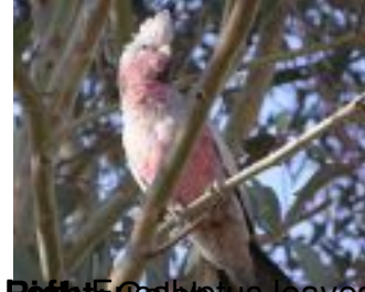
White cockatoo leaves at Christmas